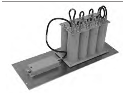
6211LP or 6211HP