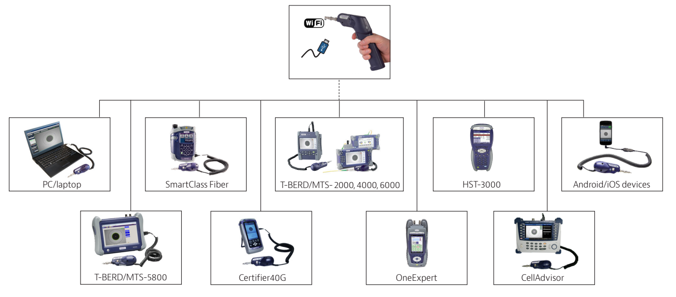
Connectable VIAVI devices include: SmartClass™ Fiber family, T-BERD®/MTS family, OneExpert™ (ONX) family, CellAdvisor®, Certifier40G™, and MP-60 optical power meter

As an all-in-one inspection solution, the FiberChek probe rarely needs to connect to other devices. However, many technicians already use other devices as part of their testing and do not want to disrupt their existing workflows. That's why FiberChek integrates with other VIAVI test devices to significantly improve productivity when you use them together. FiberChek can function independently of another test device, saving time by letting technicians test their next ports while an existing test is still in process.