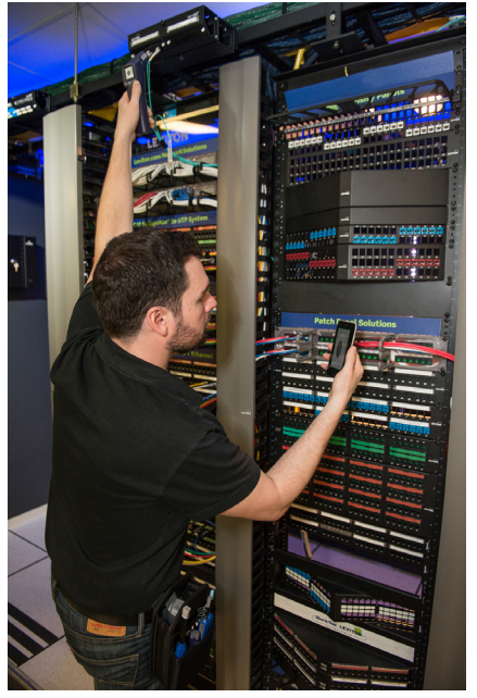
Viewing FiberChek probe results on a smartphone