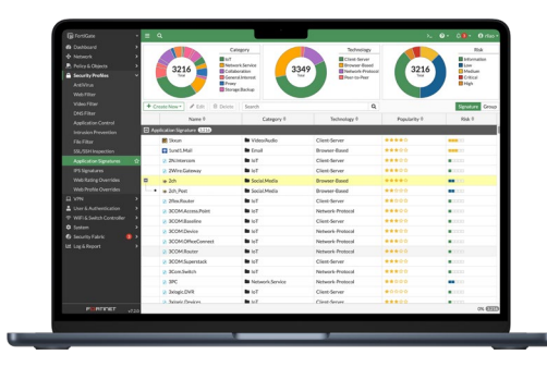
Visibility with FOS Application Signatures