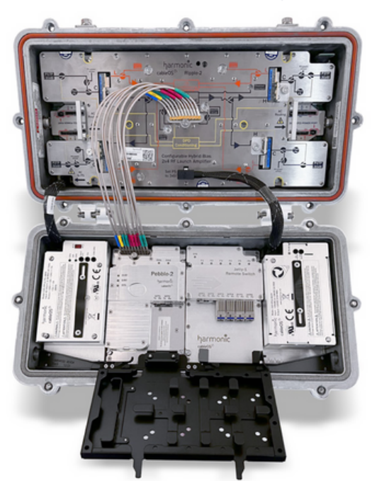
Each Ripple-2 node can house one RPD, one Jetty, two PSUs and an RF launch amplifier.

All controls and settings on Ripple-2 are performed remotely using the cOS CLI. Remote control functionality and minimal plug- ins allow for simplified setup and removes the need for technician guesswork for forward- and return-path segmentation settings. All configuration settings are stored in non-volatile memory in the RPN itself. Upon replacement of any modular RPN component, the new component automatically receives the replaced component configuration.