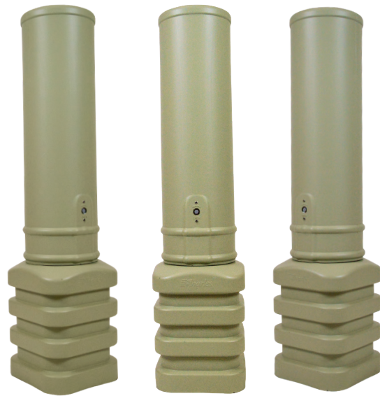
Series 3 Fiber Pedestal

Series 3 pedestals are developed as a response to unprecedented industry demand. These pedestals offer the same interface to access, construct, and deliver service as our current popular existing pedestals. In addition, Series 3 pedestals are built of the same thermoplastic resin as our broadly utilized CMPH and Broadband Pedestals with over 20 years of field-proven performance.