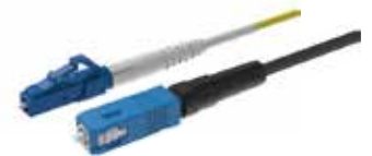
FUSION SPLICE-ON CONNECTORS