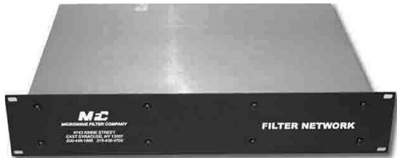
R17700 Rack Mount

Deletes an entire QAM channel for the purpose of reinserting alternate programming (e.g. - Instructional, Security Camera, etc.).