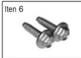
Pair of Screws