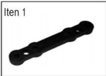
input cable fitting