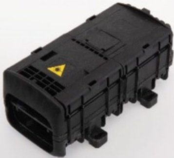
OFDC A4 Series

CommScope offers the industry's most versatile Outdoor Fiber Distribution Closure (OFDC) family. Including three different series, the OFDC family accepts a wide range of distribution and drop cables thus responding to virtually all application requirements. Each series has a common housing that can be configured to handle different connectivity solutions; such as splice-only, pre-connectorized drop cables, and field-installable connectors (FIC)—significantly simplifying training. Modularly built, it allows easy integration of optical components, even at later deployment stages, and easy pass-through cabling. Advanced gel sealing technology ensures fast and easy field handling without a need for special tools. The field friendly design can be installed in pedestal, hand hole, pole or strand mount applications for fast and easy integration into the FTTx network. Strand, Ped and Pole mount bracket accessory kits are also available for easy installation.