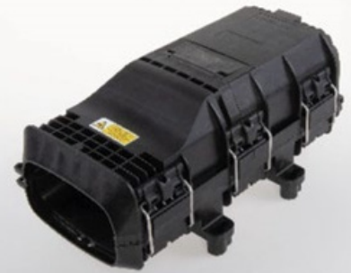
OFDC B8G Series