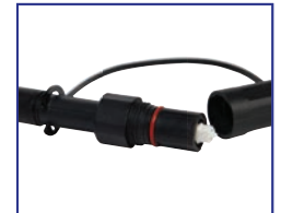
HDC FULLY COMPATIBLE OptiTap® STYLE HARDENED SOLUTION

Compatible with Fusion Splice-On Connector (FSOC) in accordance with the industry standard