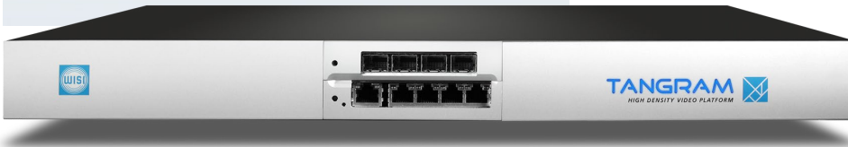
Tangram chassis shown with GT12 module.

Rest easy with reliable 24/7 operation thanks to quality WISI engineering and strong North American technical support