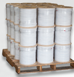
1000 ft reel