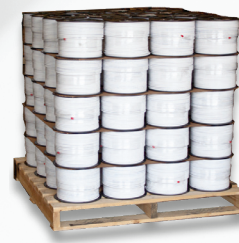
500 ft reel