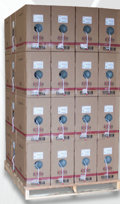
1000 ft box